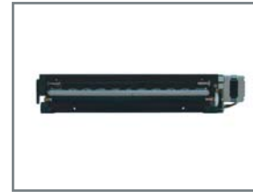
A4 Printer Mechanism

Sensors that reports every move to the host 1 Adjustable Near-End Sensor 1 Black Mark Sensor 1 Anti Paper Roll Up Sensor 1 Paper End Sensor 2 Paper Jam Sensor 2 Presenter Sensor 2 Cover Open Sensor 1 TPH Up/Down Sensor 1 TPH Thermistor 1 Cutter Sensor