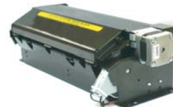
No Presenter MTP-8100C

MTP-8100P is Equipped with High-Performance A4 printer Mechanism. (MTP-8100B)