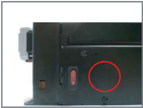
Anti Paper Roll Up Sensor

One of the worst thing could happen on Kiosk printer is paper jam, specially when paper rolls up on platen roller.