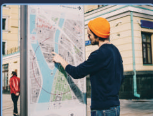
Outdoor Information Kiosk