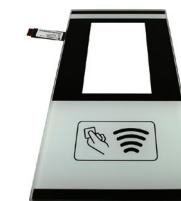
Projected Capacitive Touch Screens