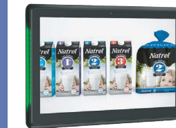
Interactive Digital Signage