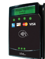
Cashless and Secure Payment