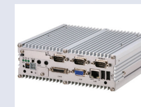
Industrial and Embedded PC